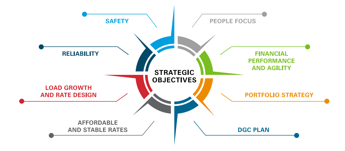
The strategic objectives will be accomplished through department initiatives.

In addition to the new mission statement, values, and cooperative-wide goals, strategic planning efforts included several strategic planning sessions with directors, the senior leadership team, and other staff presenters. The most recent meeting was held in June at Basin Electric's Headquarters in Bismarck, North Dakota. The next meeting is scheduled for November.