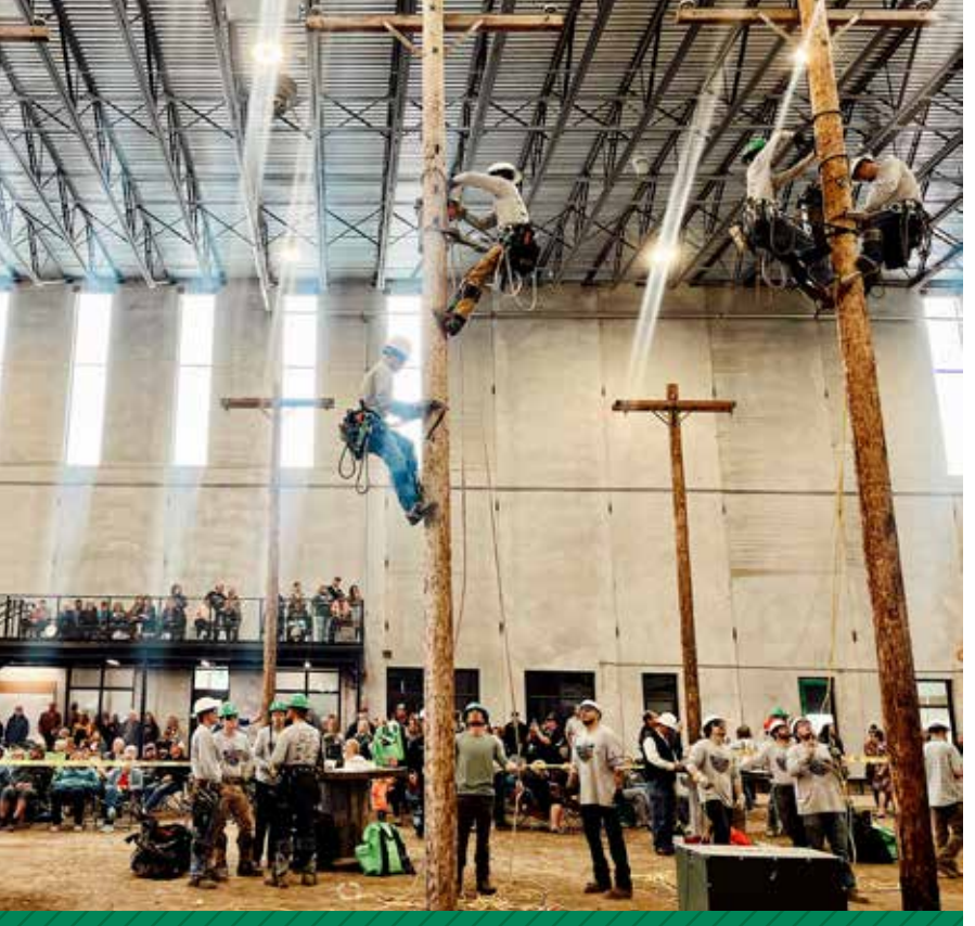
The Lineworker program at Bismarck State College is taught at the NDAREC training center northwest of Mandan, North Dakota. It is the only program of its kind in North Dakota.

prepares students to keep the transmission of electricity reliable and affordable for consumers and teaches them how to restore power through directions given to field crews.